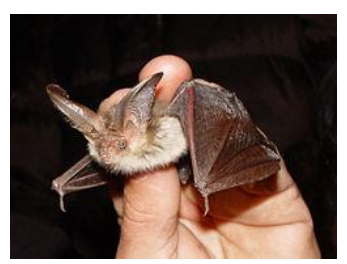
A Brown Long-eared bat

These two species also are very sensitive to light, and are deterred by modern street lights which should not be placed near hedges, mature trees and tree lines. Lighting these areas makes it more difficult for bats to forage for insects, especially moths in the lit area.