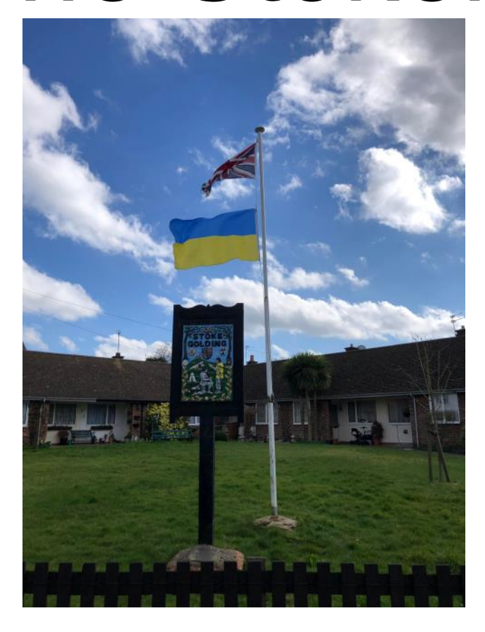
Stoke Golding Village Magazine